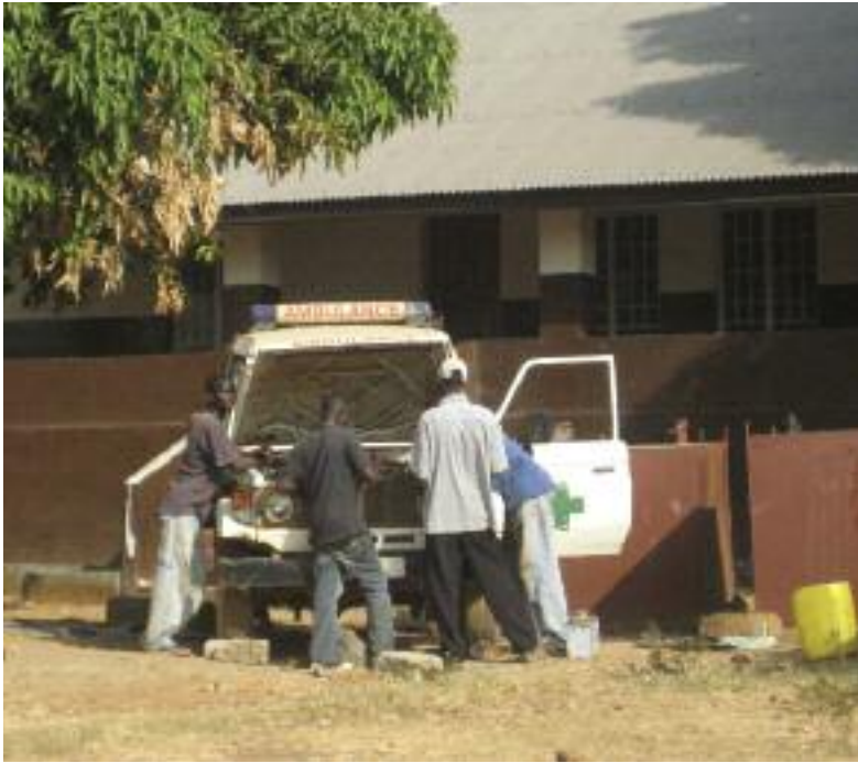
A broken ambulance – women needing to reach a hospital will have to find another means of transport.

personal travel, charging fees for their use and keeping the money, and claiming reimbursement for non-existent repairs. 82