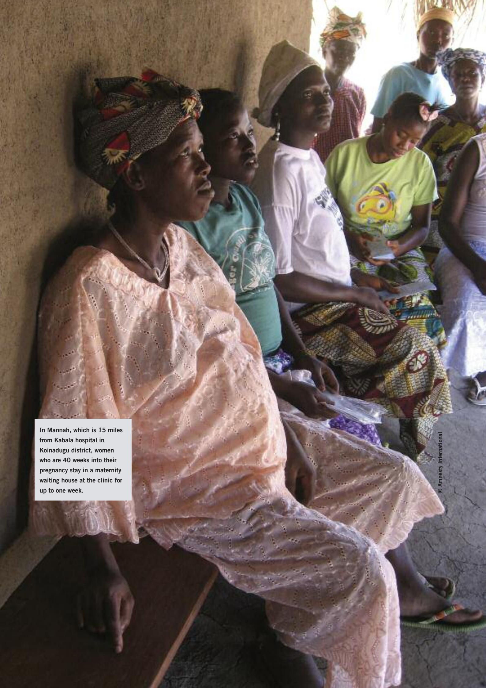
In Mannah, which is 15 miles from Kabala hospital in Koinadugu district, women who are 40 weeks into their pregnancy stay in a maternity waiting house at the clinic for up to one week.