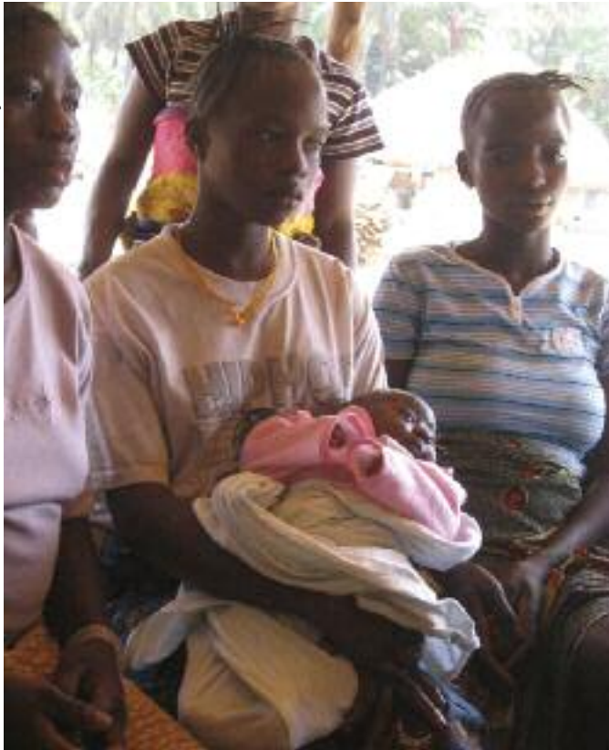
Pregnant women and girls, some as young as 16, in a village in Koinadugu district, northern Sierra Leone, February 2009.

rights groups. 33 Currently, Amnesty International members from Sierra Leone are working with civil society groups and local communities to abolish the practice completely.